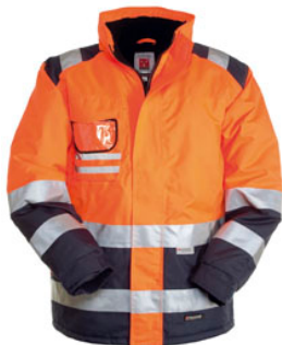
FLUORESCENT ORANGE/NAVY BLUE