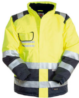
FLUORESCENT YELLOW/NAVY BLUE